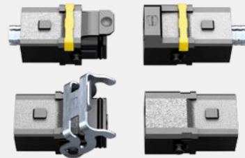
Locking mechanism with snap-in latch or robust metal locking lever